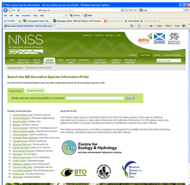
Figure 2. The web page of the GB Non-native Species Information Portal at: https://secure.fera.defra.gov.uk/nonnativespecies/factsheet/