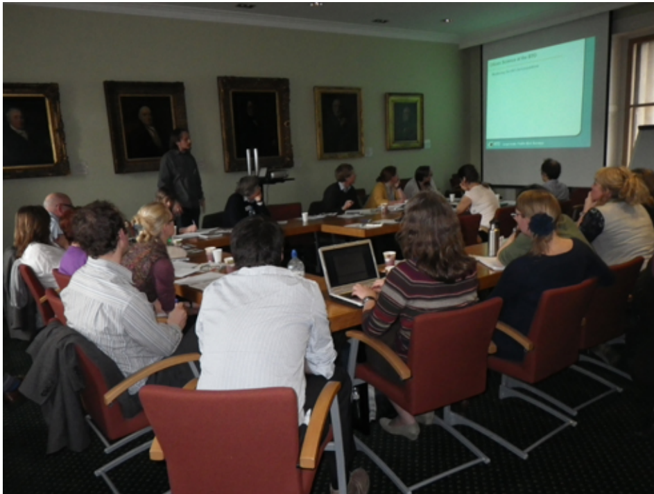
Figure 3. Participants at the workshop at the Linnean Society, London.

Communication and integration amongst marine recording schemes needs to be fostered by leadership from key organizations. For example, the MBA and Biological Records Centre can speak for the community and pull all the elements (data, science and policy needs, publicity etc.) together. This should not be a “top-down” approach; rather the aim should be to ensure that the volunteer recording community is getting what it wants.